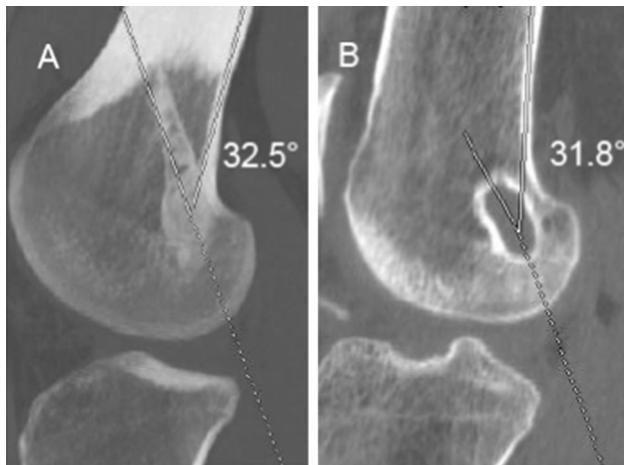
Fig. 1 Sagittal obliquity defined by the angle subtended between the tunnel and longitudinal axis of the femur. In this case, the angle is 32.5° for the in-out group (a) and 31.8° for the out-in group (b)

All patients underwent standardized evaluation at follow-up. This included assessment on Tegner and Lysholm scales, International Knee Documentation Committee (IKDC), and KT-1000 (MEDmetric, San Diego, CA) knee arthrometric evaluation.