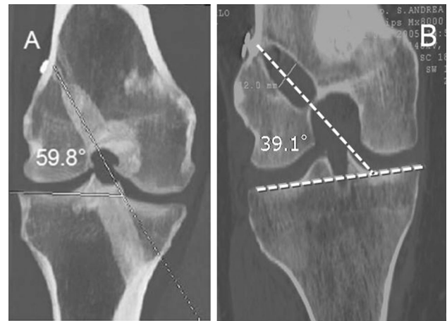
Fig. 2 The coronal obliquity is shown on these CT images. A line parallel to the joint line and the femoral tunnel was used to calculate the coronal obliquity. In this case the value is 59.8° for the in-out group (a) and 39.1° for the out-in group (b)

No differences were found between the baseline characteristics of the two groups (Table 1). No postoperative complications were recorded in either group.