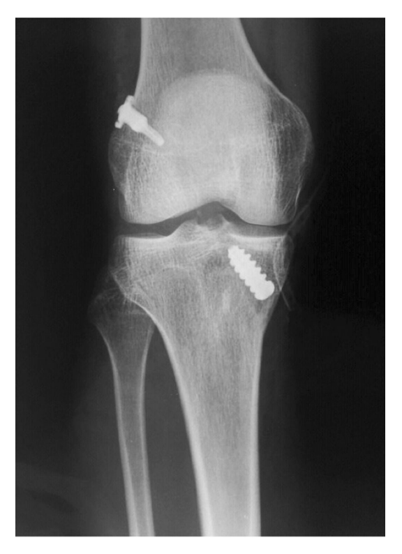
Fig. 2 Postoperative anteroposterior radiograph of the right knee subjected to ACL reconstruction, showing femoral fixation with the ETD<sup>®</sup>

Arthroscopy was performed, followed by treatment of possible meniscal and chondral injuries and ACL reconstruction via flexor tendon graft fixation to the tibia using a metallic interference screw. In the femur, the Endo Tunnel Device<sup>®</sup> (ETD) (Proind, Cotia, São Paulo, Brazil)—a suspension device for femoral fixation—was used (Figs. 1, 2, 3). The ETD has various implant diameters and lengths. The diameter varies from 7 to 9 mm, and the length can be