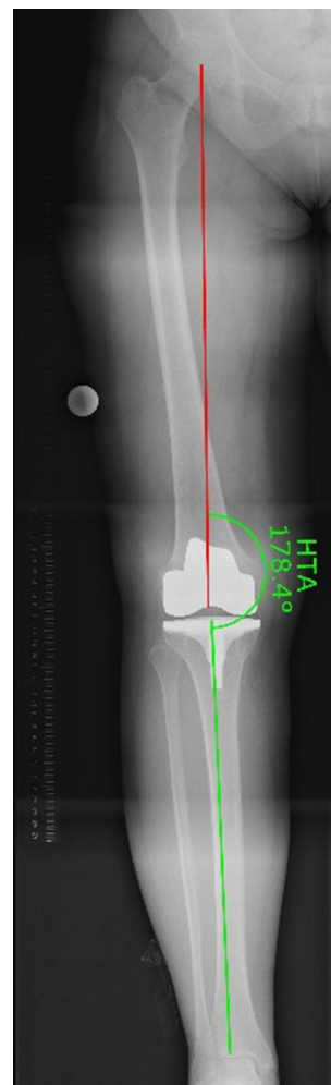
Fig. 1 Measurement of HTA angle (HTA angle between the mechanical axis of the femur and mechanical axis of the tibia)

The collected data were analyzed using Pearson's correlation coefficient (PCC) using simple linear regression,