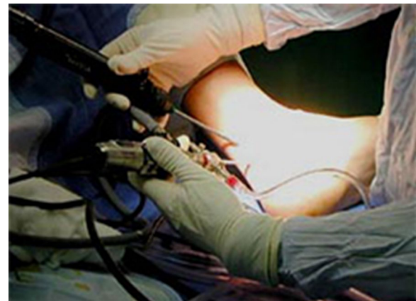
Fig. 2 Intra-operative image of portals during surgery