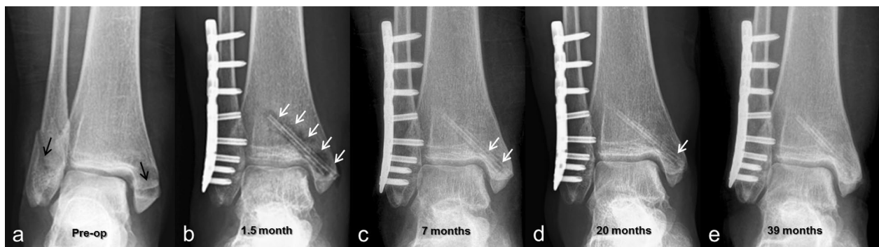
Fig. 2 a Preoperative AP ankle radiograph of 45-year-old female patient with a bimalleolar fracture at initial admission (black arrows showing fractures); b Lateral malleolar fracture fixed with plate and screws and medial malleolar fracture fixed with two bioabsorbable Mg screws. At 1.5-month follow-up, gas shadows were observed around screws (white arrows); c At 7th month visit, fracture was united, and significant decrease in gas shadows was seen; d At 20th month follow-up, almost no gas shadows were visible; e At final follow-up, faded silhouette of screws was hardly noticeable