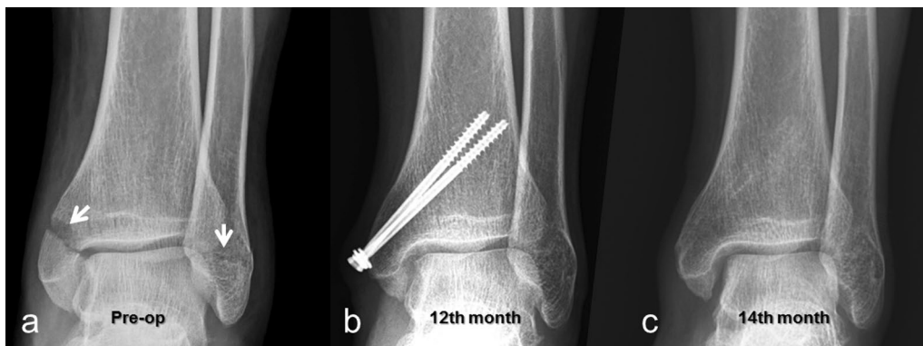
Fig. 1 a Preoperative anteroposterior (AP) ankle radiograph of 44-year-old male patient with bimalleolar fracture (white arrows showing fractures); b At 12-month follow-up, fracture was united, but patient had pain over medial malleolus; c AP ankle radiograph 2 months after removal of screws

In this study, the fixation of MM fractures with two different implants was retrospectively compared. Clinical results at final follow-up were similar in both groups. Fracture union was achieved in all patients without major complications. Radiologically similar results were obtained regarding the development of posttraumatic osteoarthritis. However, the incidence of implant removal was statistically higher with titanium screws. Clinical and radiological outcomes in fixation of MM fractures with Mg screws were not inferior compared with titanium screw fixation, while this provided an