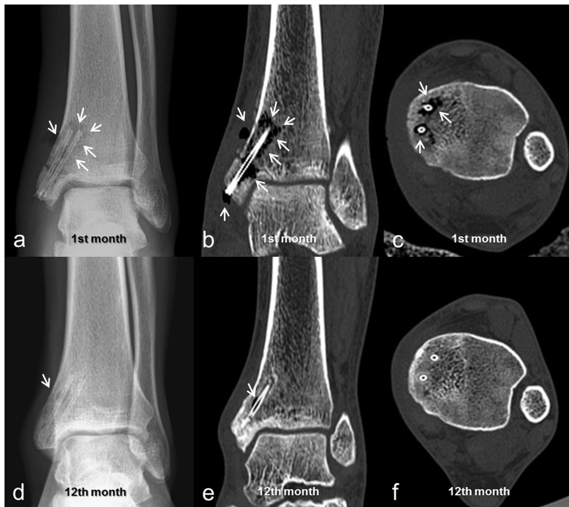
Fig. 3 a Early postoperative ankle radiograph of 21-year-old male patient with isolated medial malleolar fracture. Fracture fixed with two bioabsorbable Mg screws. Note gas both in soft tissue and around screws (white arrows); b Coronal and c axial CT taken at first-month follow-up showed gas formation around screws and scattered throughout cancellous bone (white arrows); d AP ankle radiograph at first-year follow-up, almost no gas accumulations were seen. d Coronal and e axial CT taken at first-year follow-up confirmed almost total absorption of released gas

important advantage as implant removal was prevented. Therefore, it can be argued that the use of bioabsorbable Mg implants is as safe and effective as conventional implants and does not require removal of the implant.