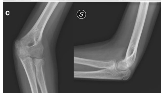
Fig. 1 a Radial neck fracture Judet type III. b Osteosynthesis with ESIN, postoperative X-rays. c X-rays at 3 months, after nail removal, showing an excellent alignment