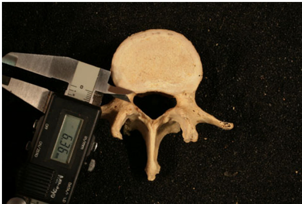
Fig. 4 Pedicle length was measured from the superior aspect. The average of both pedicles was used in the study