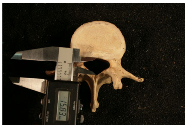
Fig. 3 Measuring the SCD from the superior surface of the vertebra

the area at each level was created, and values that were less than the mean minus two standard deviations (SD) were considered stenotic. Stenosis was defined and, for each specimen, the age, sex, and race were also recorded.