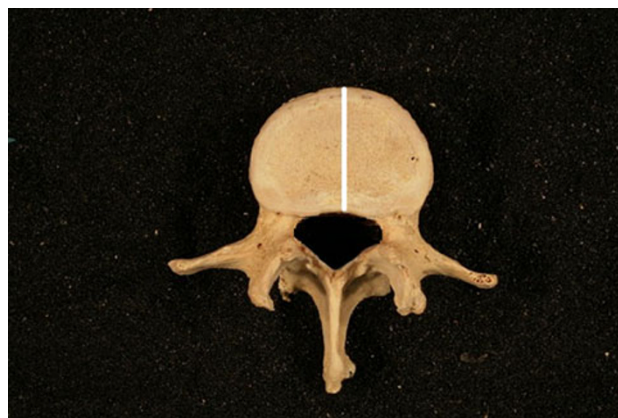
Fig. 1 Calculation of the body diameter of the lumbar spine in the anteroposterior plane

After the measurements had been taken, the area at each level was calculated using a standardized geometric formula (Fig. 5). To verify these calculations, computerized measurements were done using ImageJ on a random sample of 20 lumbar vertebrae. Results were compared and the kappa value was found. A standard distribution curve for