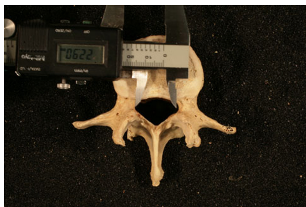
Fig. 2 The measurement of IPD after proper alignment of the vertebra