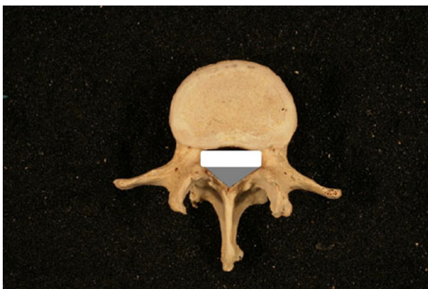
Fig. 5 Calculation of the canal area. The total area was calculated as the sum of the area of the rectangle (shaded white) and the isosceles triangle (shaded gray)

The Torg ratio was calculated by dividing the SCD by the VBD. Likewise, Torg ratios that were less than the mean – 2SD were considered to be “below normal.” With this defined, an analysis of deviance using stepwise multivariate linear regression models was performed to determine if the Torg ratio was associated with canal area and if a “below normal” Torg ratio was predictive of lumbar stenosis for each subject. The standard p -value cutoff ( p < 0.05) was used in the study.