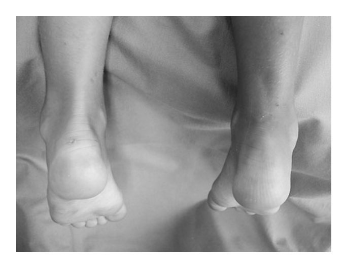
Fig. 3 Under general anesthesia and in the prone position, the right foot showed slight dorsiflexion due to the prevalence of the extensor muscles