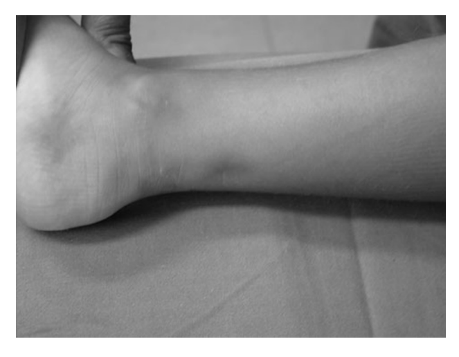
Fig. 1 An Achilles tendon gap was present under the skin at physical examination