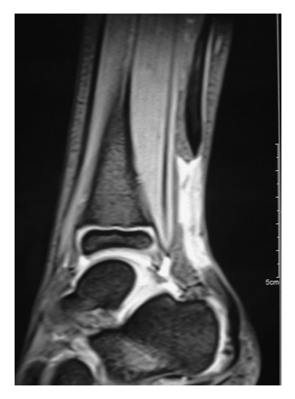
Fig. 2 A chronic full-thickness tear of the right Achilles tendon with a gap of 5 cm was present on MRI

the full equinus position, utilizing the plantaris gracilis tendon as an augmentation (Fig. 5). The skin was then closed under extreme tension with reabsorbable sutures. A non-weight-bearing short leg cast in the equinus position was then used for 2 weeks, followed by a new short leg cast in a less equinus position to recover the plantigrade position for three weeks. After the cast was removed, a physical therapy program was prescribed for 3 weeks to