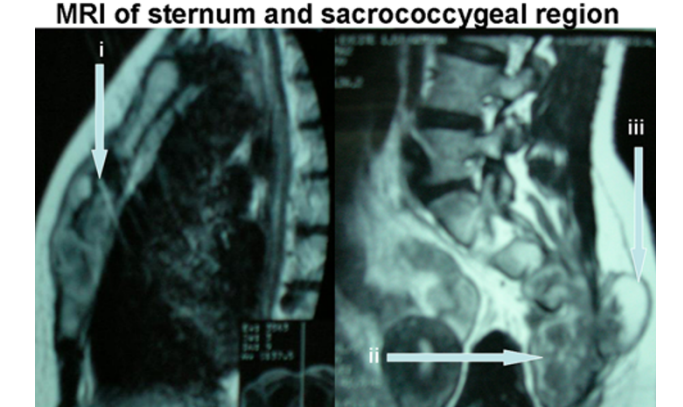
Fig. 1 Magnetic resonance imaging of the sternal and sacrococcygeal regions. i Destructive lesion in the sternum, ii destructive lesion in the coccyx with an abscess, iii abscess extending into the left gluteal region