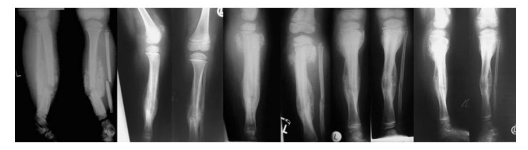
Fig. 1 This 3.5-year-old girl (neurosegmental level of lesion below L3) sustained a fracture of the left lower leg with no history of injury. Bilateral clubfoot surgery with subsequent 10-week plaster cast immobilization had been performed 11 weeks prior to the fracture.

detect possible differences in bone mineral density (BMD) z-scores between level of neurological impairment and ambulatory status. Boxplots were used to visualize the findings. Level of significance \alpha was set to 0.05.