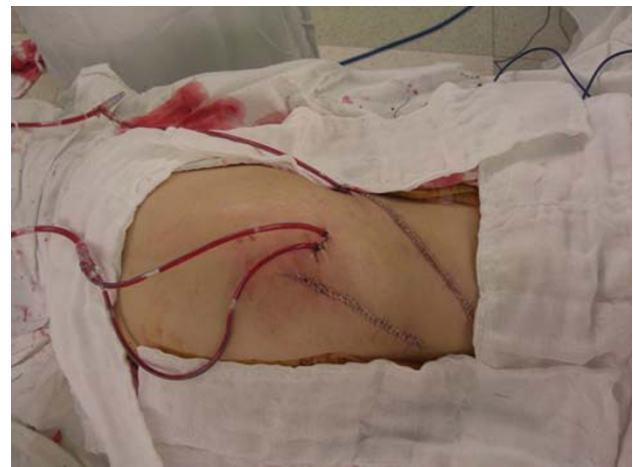
Fig. 2 The apparent buttock abscess was eliminated by direct approach over the lesion below the iliac wing, and the psoas and retroperitoneal abscess was eradicated by anterolateral retroperitoneal approach above the iliac wing. The closed suction drain was inserted into the retroperitoneum through the communicating channel between the buttock and the psoas lesions

The psoas abscess is rare [1, 2], and those presenting as extrapelvic extension are even more rare. The psoas abscess that extends over the iliac wing and presents as a flank or buttock abscess is a much rarer clinical feature, with only a few case reports in the medical literature [3, 9,