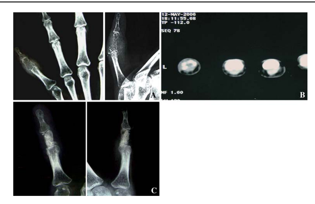
Fig. 5 a Radiograph (AP, lateral) reveals an expansile lytic lesion with cortical break. b CT scan of the middle phalanx showing marked osteolysis. c Postoperative radiograph (AP, oblique) at 14 months showing incorporation of the cancellous graft