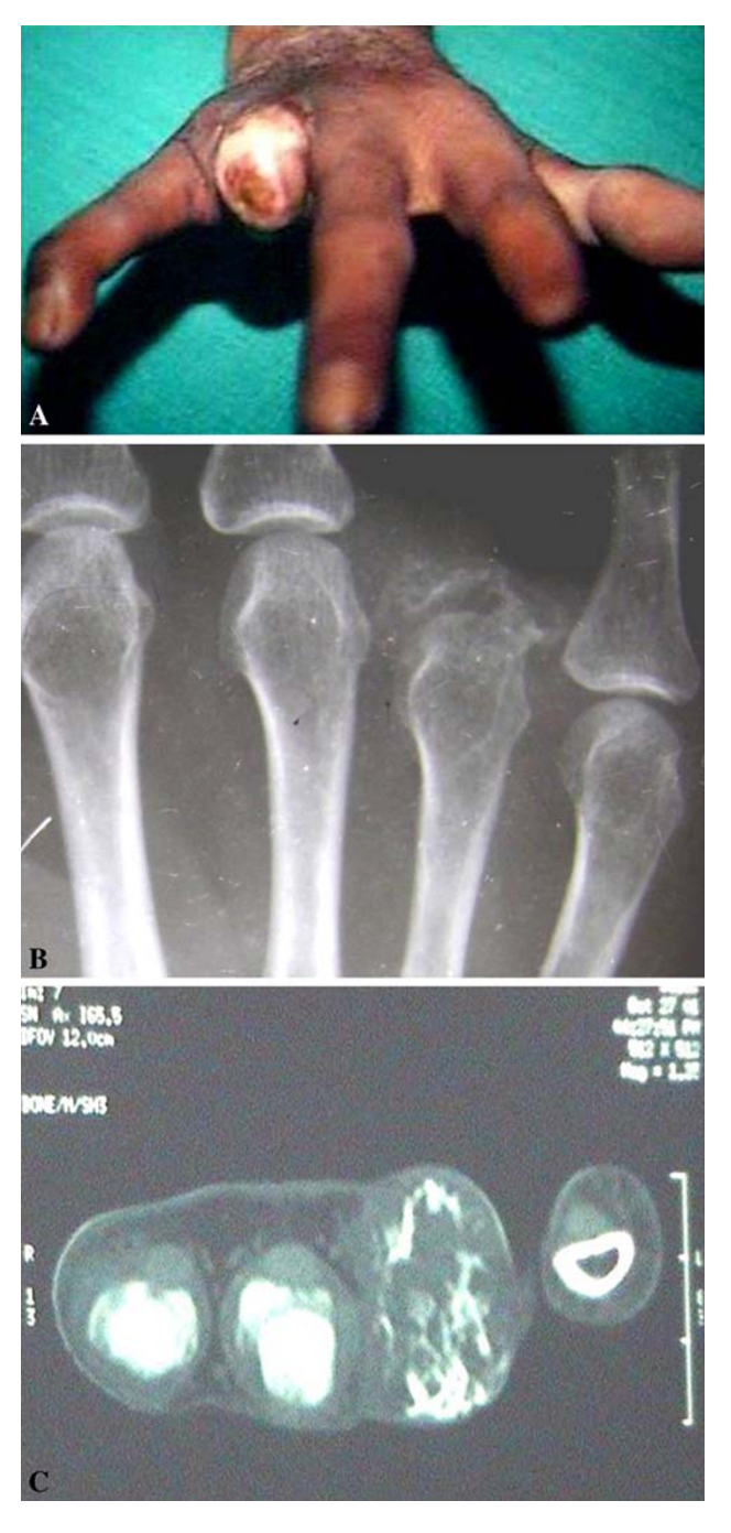
Fig. 2 a Amputation stump with ulcer at the tip. b Radiograph showing partial amputation of the proximal phalanx with expansile lesion involving the articular surface. c CT scan showing the irregular expansile lytic lesion with cortical erosion

A 26 year old female presented with a painless swelling of the left little finger of six months duration without any history of trauma or fever.