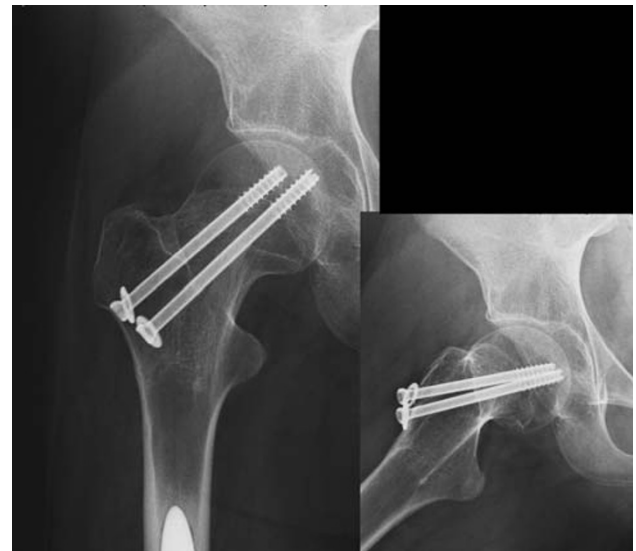
Fig. 4 X-rays showing that the fracture had healed at one year of follow up

Neoadjuvant and adjuvant chemotherapy caused a revolution in the treatment of musculoskeletal sarcoma, increasing the percentage of treatment success. The most popular treatment protocol is based on the administration of four