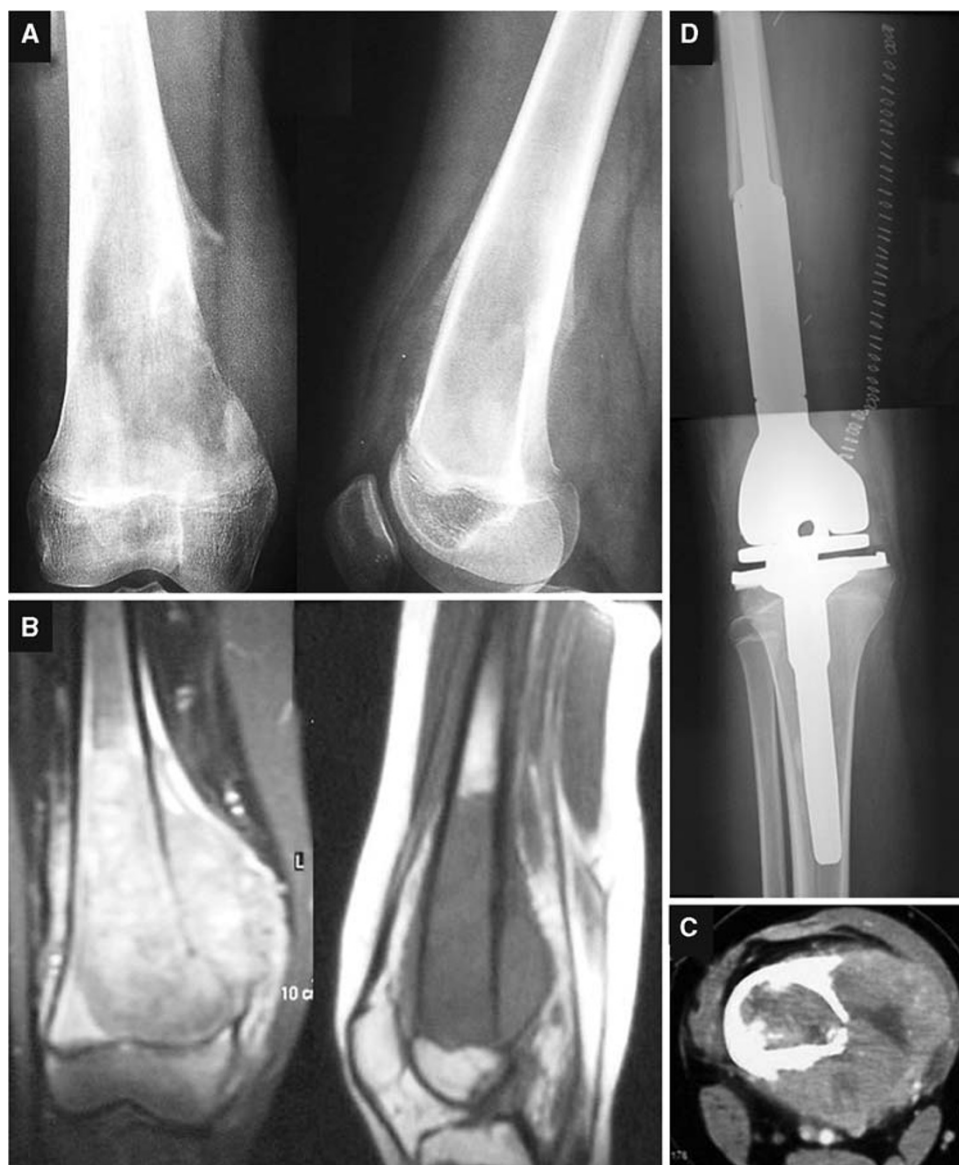
Fig. 1 a–c Preoperative images showing a mass in the medial aspect of the distal femur. d Postoperative X-rays showing the prosthesis at the site

and hypointense on T1-weighted images. It extended throughout the whole distal femur eroding medial cortex and periosteum without exceeding the epiphyseal plate; this condition was confirmed by TC (Fig. 1c). Bone scans revealed intense local uptake and no bone metastasis; this condition was also evident in total-body TC.