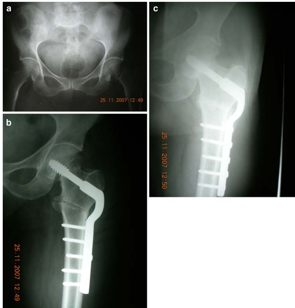
Fig. 2 a Radiograph showing non-union fracture neck of femur (21 weeks old). b Immediate postoperative radiograph showing more horizontal fracture line with valgus osteotomy fixed by dynamic hip screw and 120° double angle barrel plate. c Union achieved after 10 weeks of valgus osteotomy

united fractures were able to sit cross-legged, squat and do one-leg stance. Pain and limitation of motion improved remarkably, so that the majority of the patients did not have to use crutches at 6 months after operation.