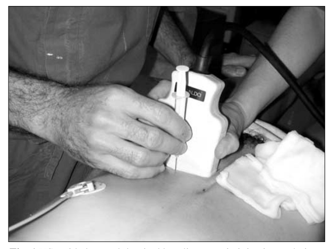
Fig. 1 US-guided transabdominal botulinum toxin injection technique for the psoas muscle

The patient is sedated and in the supine position (Fig. 1). US examination of the abdomen is performed with a 5–7.5 MHz linear probe (Hitachi, Tokyo, Japan), displacing the intestinal loops medially starting from the paramedian lower quadrants. Visualisation of vertebral bodies and major iliac vessels serve as a reference. Lateral to the spine, the body of the psoas muscle is visualised and identified thanks to its movement, which is synchronous during hip flexion–extension. A needle of adequate length is used and botulinum toxin is diluted with at least 2 ml of saline solution. The drug is injected in 4 sites, starting caudally or paraumbilically with US visualisation of liquid flow coming out of the needle.