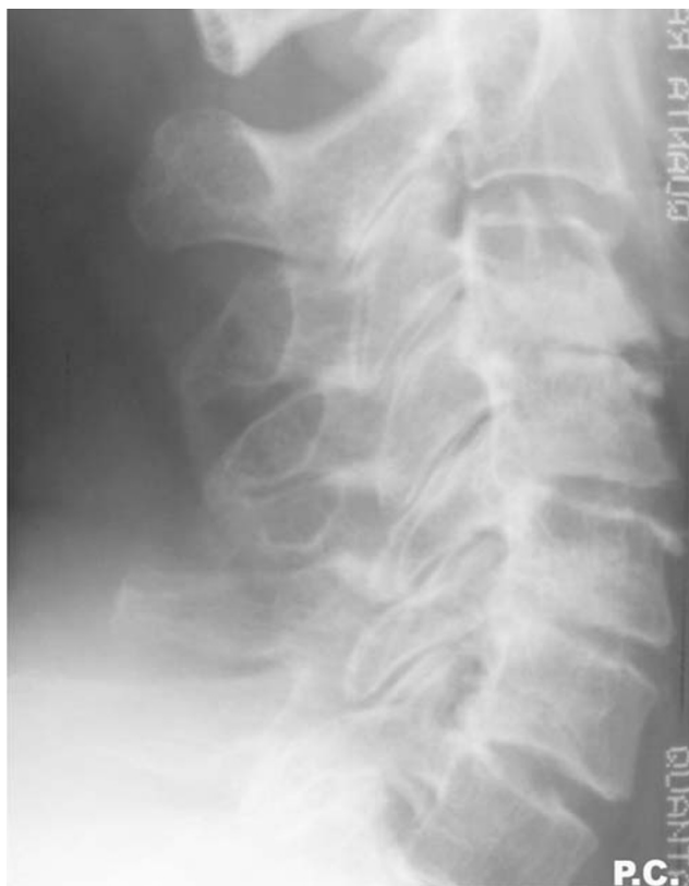
Fig. 1 In this patient, we see the different grading scales for disc space narrowing rated by one observer as C2/3 = 0, C6/7 = 1, C4/5 = 2, C5/6 = 2, and C3/4 = 3

with significant facet joint sclerosis, as well as endplate sclerosis. Since this was to be an assessment of the “segments” sclerosis, we similarly used the highest numerical value for the sclerosis of either the endplates of the segment or of the facet joints (Fig. 5).