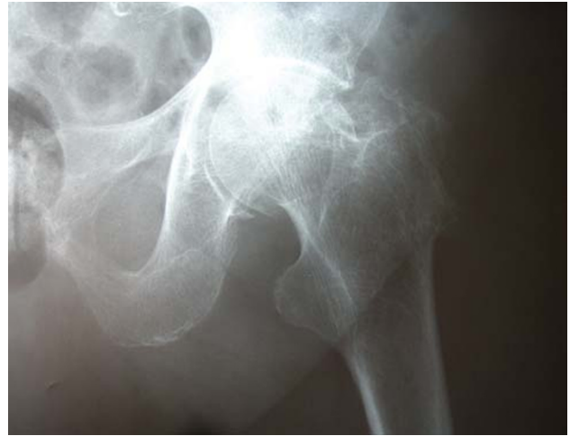
Fig. 5 Magnified view of the femoral neck region (same radiogram as in Fig. 4)—apparently healthy femoral neck

Cases of FNF after intramedullary nailing have also been described by other authors. The proposed causes vary from misplacement of the entry point to forceful removal