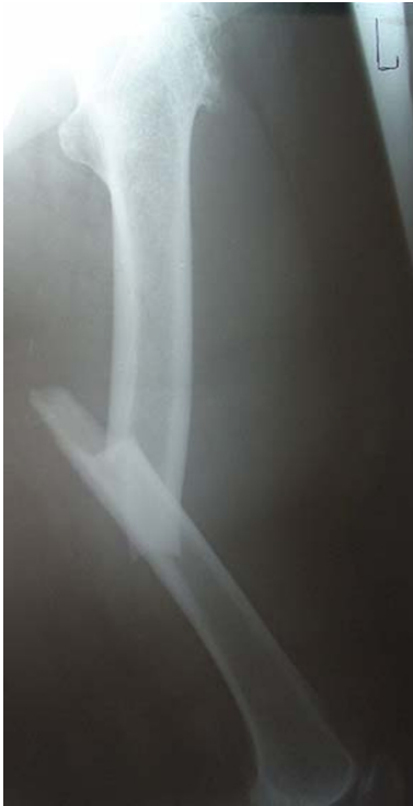
Fig. 4 Case 2: broken femoral shaft

the femur performed. The nail was short and thus advanced deeper. Except at the end stage, no technical difficulties were noticed. The end cup was placed inside the femoral neck and efforts to remove it with a vascular clamp failed. Immediate postoperative radiogram did not reveal FNF (Fig. 6).