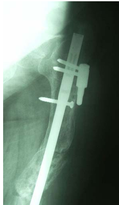
Fig. 3 Case 1: nonunion of the femoral neck and femoral diaphysis