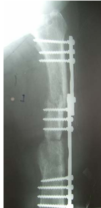
Fig. 2 Case 1: extended ZESPOL fixator after additional fracture was sustained during in-bed patient care. Apparently healthy femoral neck

proximally to incorporate the proximal fragment (Fig. 2). After three months, despite non-weight-bearing, recurrent destabilization occurred without any microbiological symptoms of infection. The implant was removed and open intramedullary nailing was performed. During this procedure significant bone fragility was evident, and the end cup was misplaced behind the femoral neck. Multiple efforts to remove it (using a finger and vascular clamps under the image intensifier) failed. After two weeks, during the first follow-up visit, a FNF (AO 31-B2) was diagnosed but the patient refused the proposed operative treatment. She came back after three months with significant shortening of the left femur and nonunions of both the neck and diaphysis (Fig. 3). During another operative intervention the end cup was replaced, and fixation of the femoral neck was attempted with two screws, one cortical interlocking through the dynamic slot of the nail and another cancellous with the “miss a nail technique.” We were not able to place additional screws due to the width of the proximal nail. The soft bone of the proximal fragment did not cause any noticeable resistance during screw placement. After three days of bed rest, the screws redisplaced and were removed. The patient remains severely disabled, walking around the house with a walker and occasionally using a Thomas splint based on her pelvis.