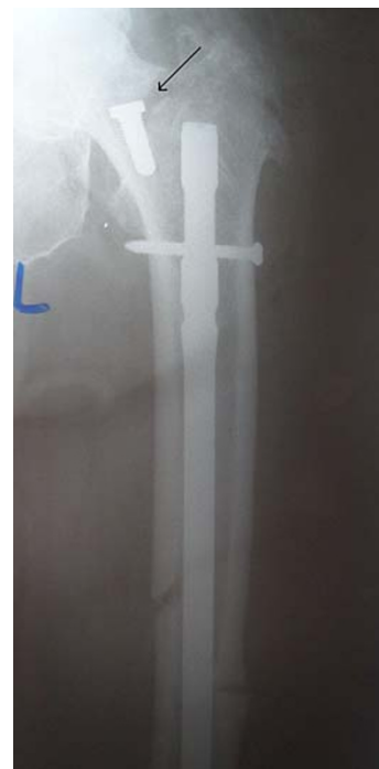
Fig. 6 Case 2: misplacement of an end cup. Visible iatrogenic injury to the base of the femoral neck ( black arrow ). Medial cortex of the femoral neck apparently intact

of a drill jammed into the femoral shaft [1]. Various types of fractures are reported, but the classification is inconsistent (Pauwels III, comminuted transverse, comminuted segmental, etc.).