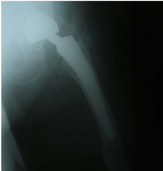
Fig. 8 Case 2: bipolar arthroplasty of the hip after intramedullary nail removal

multiple entry points (like Harper) [3]. Christie and Court-Brown [4] reported four (of 143 treated) extracapsular FNFs during closed femoral intramedullary nailing, which were attributed to an excessively lateral insertion point in the trochanteric area and to the oblique insertion of the nail. In a laboratory study of strain gauge locations on cadaver bones, researchers from the AO Research Institute found that antegrade femoral nails, introduced both into the piriformis entry point or laterally, do not induce higher strains if correspondingly designed nails are implanted the correct way. Deviations from these ideal insertion points are