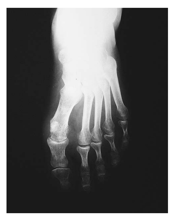
Fig. 2 AP X-ray 36 months later postoperatively; good result