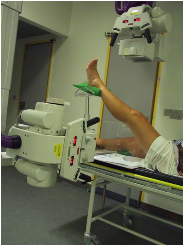
Fig. 1 Bi-planar RSA-setup with the two X-ray tubes at right angles and the patients right knee placed in the calibration knee cage. To gain overview scatter grids and X-ray film cassettes are not mounted

RSA-analyses: RSA-analyses were performed in our department at workstation using a validated [11] RSA-software program (WinRSA ver. 4.0, Tilly Medical Products, Sweden). The method for determining the position of the tibial implant in the global coordinate system arises from the kinematic model where the tantalum markers in the tibial implant and the proximal tibia bone define two rigid bodies (segments). The tantalum markers in the calibration knee cage define the global coordinate system. The proximal tibia bone acted as a reference segment for the tibial implant segment. The tantalum markers in both segments and the calibration knee cage were detected manually on the X-ray images in the two planes. It is of crucial importance that the corresponding marker is detected in the two planes and that a minimum of three corresponding markers are detectable in each segment. By mathematical transformation (interpolation of marker coordinates in the two planes) into the 3D laboratory coordinate system the RSA-software calculated the 3D position of the segments. Subsequently the migration of the tibial implant over time (according to follow-up schedule) was calculated with the postoperative examination as reference. Manual detection of markers is time consuming,